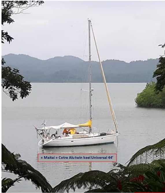
« Maitai » Cotre Alutwin keel Universal 44'