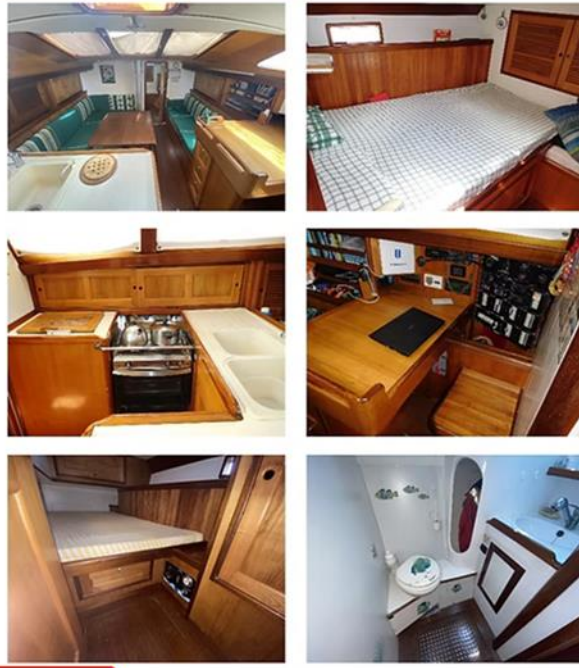
Universal 44 Description